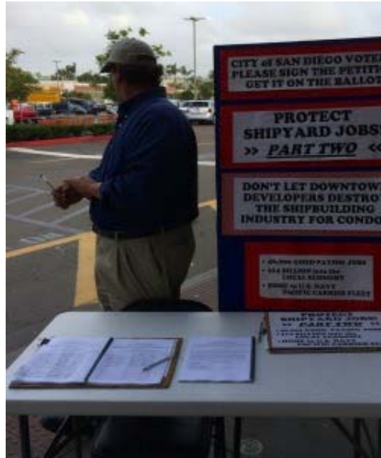
Signature gatherer outside Horton Depot who turned his back on a photographer when asked if we take his picture. 11/15/13.

Through education, advocacy, and stewardship SOHO's mission is to preserve, promote and support preservation of the architectural, cultural and historical links and landmarks that contribute to the community identity, depth and character of our region.