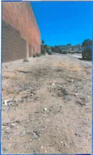
Sigsbee at Harbor, facing North East

may be a small issue but they are another small slight and disadvantage that makes it more difficult to walk, get outdoors, and encourage healthy habits for neighborhood residents young and old.