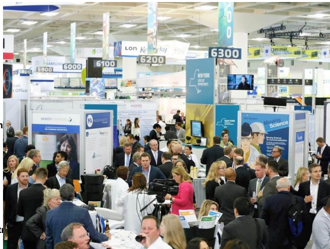
BIO held its international convention in San Diego in 2008 and 2014.

in Daily Business Report ( http://www.sandiegometro.com/category/daily-business-report/ )